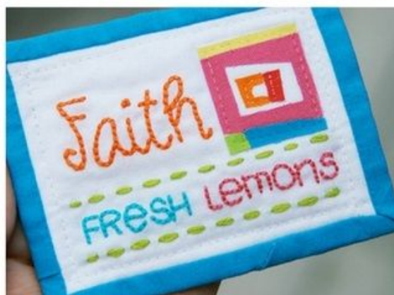
Faith Fresh Lemons