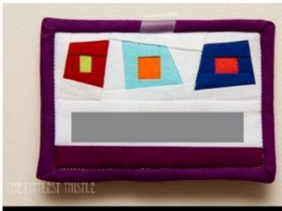
The Littlest Thistle