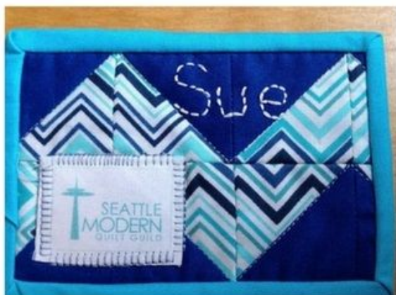
Sue Sew Crafty