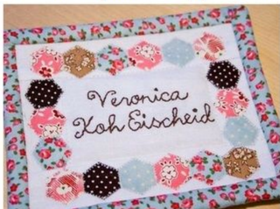
VeronicaMade on Flickr