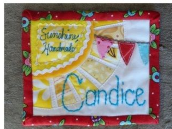
Lightning Bugz on Flickr