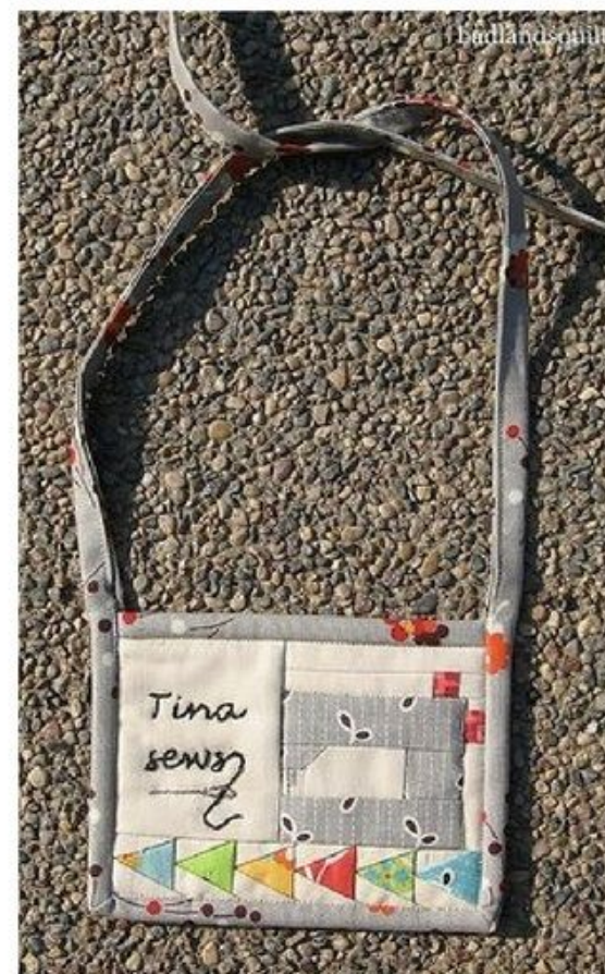
badlandsquits on Flickr