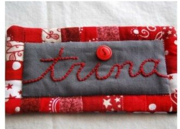
trinsadoings on Flickr