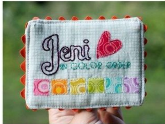
Jeni Baker In Color Order