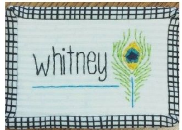
whitney (the peacock tree)