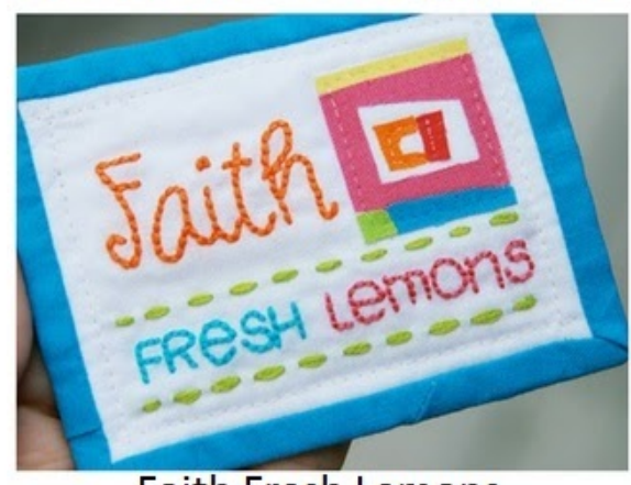
Faith Fresh Lemons