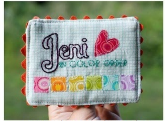
Jeni Baker In Color Order