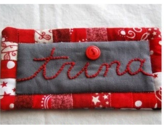
trinsadoings on Flickr