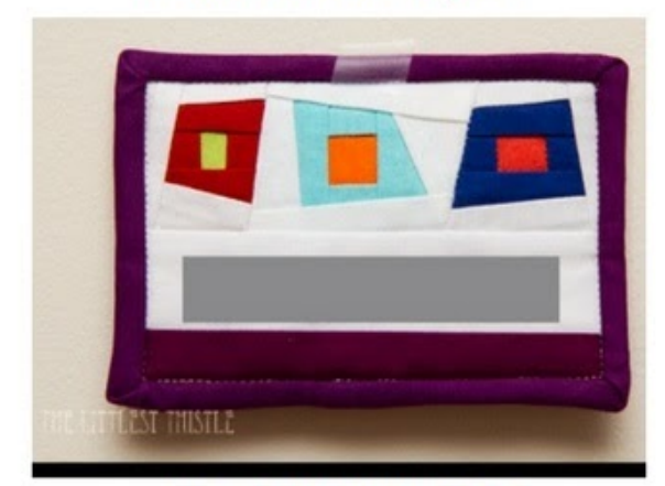
The Littlest Thistle