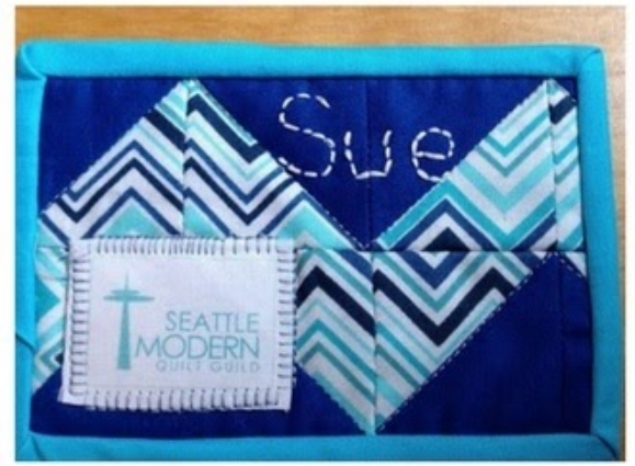
Sue Sew Crafty