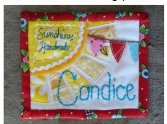
Lightning Bugz on Flickr